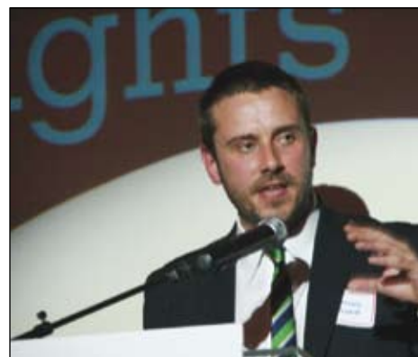
Featured speaker Jeremy Scahill, author and Democracy Now! correspondent.

annual event that honors the generous benefactors who are the Center's indispensable partners in advancing and protecting fundamental human rights for all. Thank you to all the vendors and volunteers who made the event such a success.