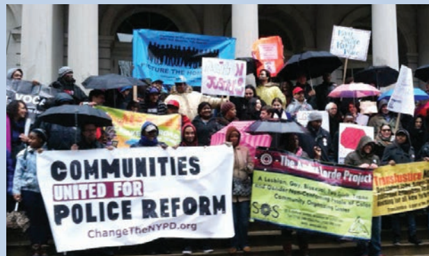
Hundreds launch new Communities United for Police Reform Campaign on steps of City Hall

CCR is proud to be a key member of Communities United for Police Reform (CPR), an unprecedented citywide campaign to end discriminatory policing practices, including stop and frisks, in New York, bringing together a movement of community members, lawyers, researchers and activists to work for change. The nearly 30 partner organizations in this campaign come from all five boroughs, from all walks of life and represent many of those unfairly targeted by the NYPD.